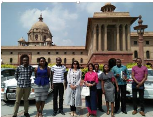
Participants with CHRI staff in front of North Block