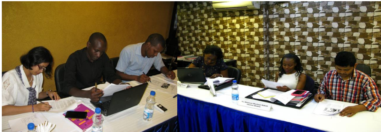
Participants drafting ATI requests as part of the skill development session.

Using the ATI Act for making Information requests: skill development session including group work: